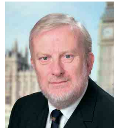
Andrew Miller MP, Chairman